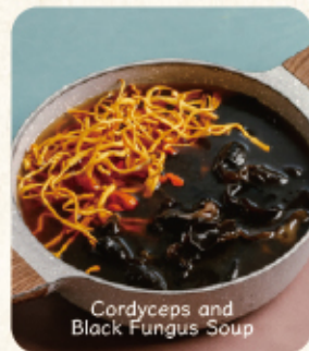
Cordyceps and Black Fungus Soup