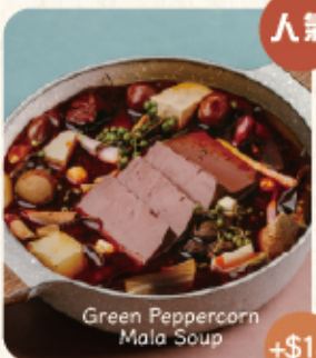
Green Peppercorn Mala Soup