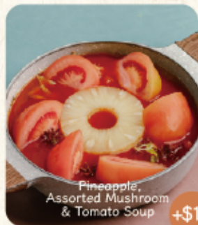
Pineapple Assorted Mushroom & Tomato Soup