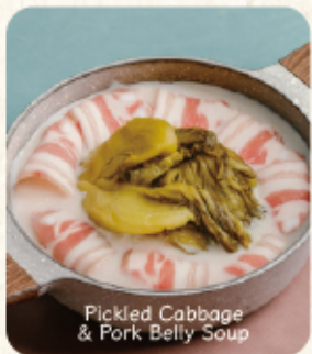
Pickled Cabbage & Pork Belly Soup