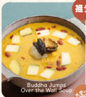
Buddha Jumps Over the Wall Soup